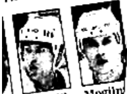
Henrik Lundqvist Nikolai Khabibulin